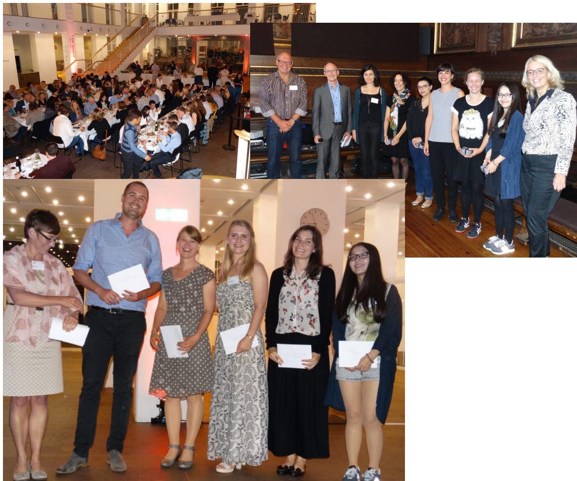
Conference dinner at the National Museum (top); Organising Committee 2016 (right); Poster Prize Winners 2016 (bottom)

In total, 153 participants from 26 different countries attended NuGOweek 2016.