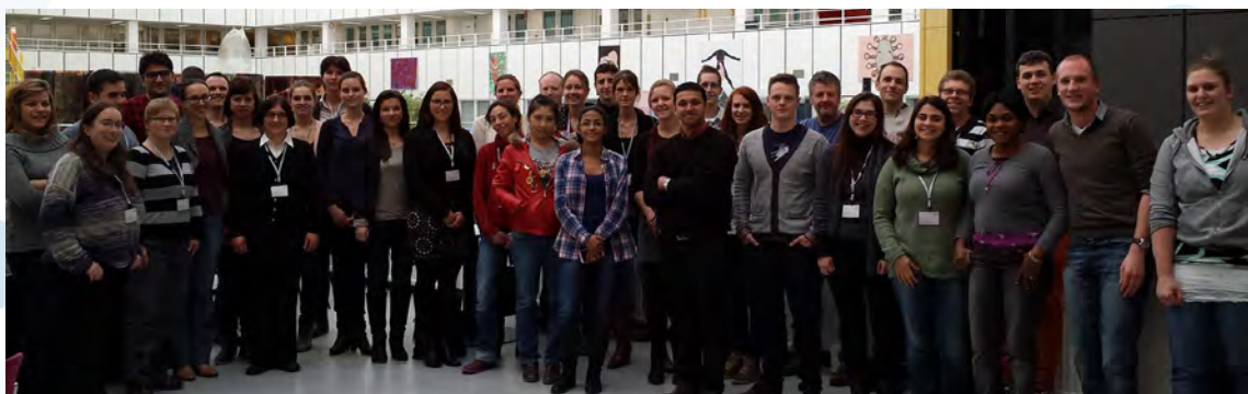
Microarray analysis using R & Bioconductor (January 2014, Maastricht - NL)