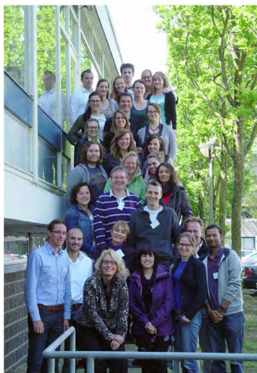
Advanced visualisation, integration and biological interpretation of -omics data

7 - 8 May 2014 Wageningen, The Netherlands